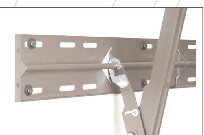
PaneLock<sup>™</sup> secures mounting arms to wall plate

This revolutionary design features security screws that require a custom allen wrench (included) to attach and detach the hardware. Plus, it's backed by our industry-leading Lifetime Guarantee.